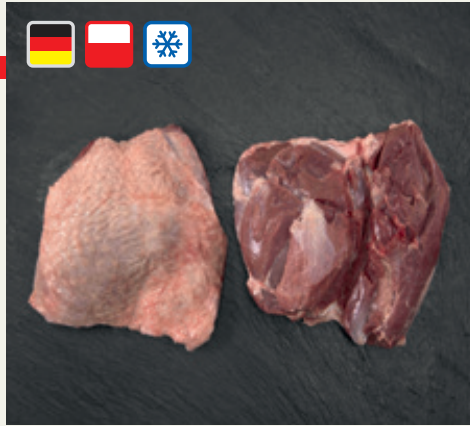
Turkey thigh meat with skin