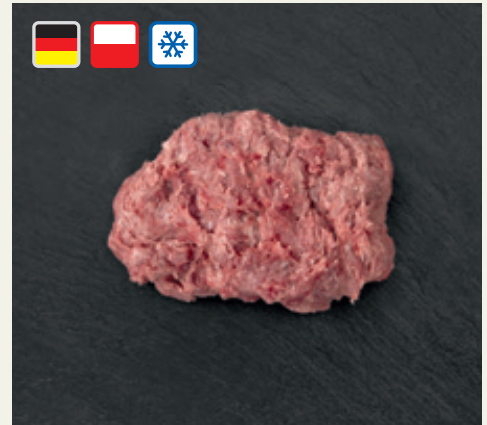
Turkey mechanically separated meat