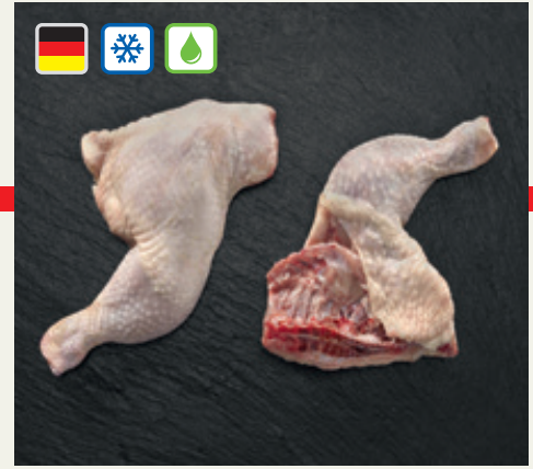
Chicken leg quarter with tail