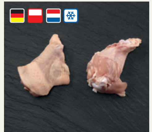
Chicken prime wing