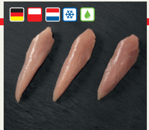
Chicken inner fillet