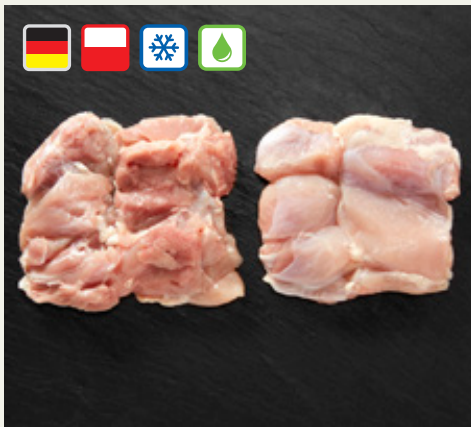
Chicken leg meat without skin