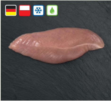
Turkey inner fillet, male