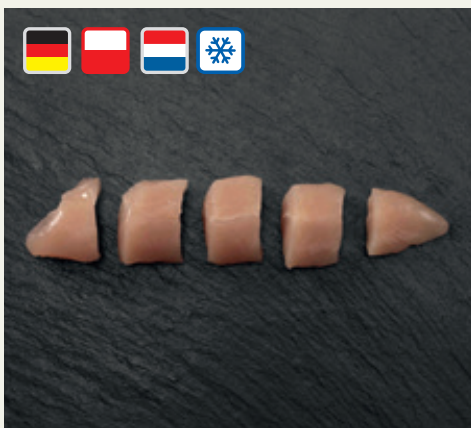
Chicken inner fillet trimming