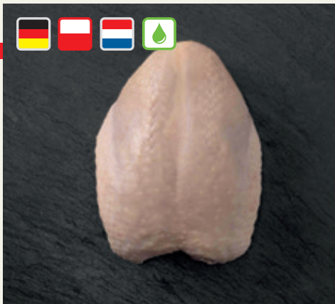
Chicken breast with skin and bones