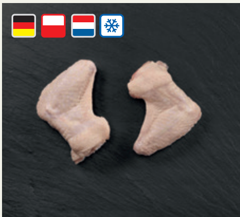
Chicken wing, two-joint