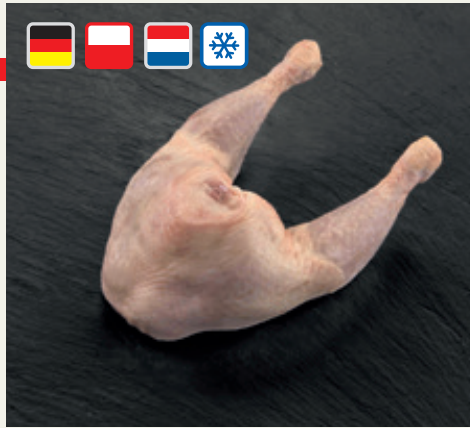
Chicken saddle without tail