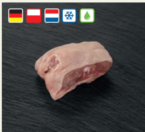
Chicken lower back