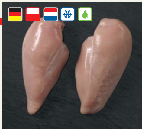
Halved chicken breast fillet without skin