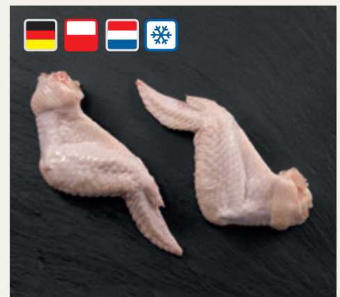
Chicken wing, three-joint