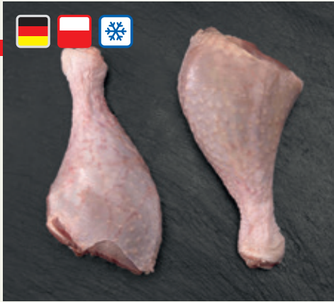
Turkey drumstick, male