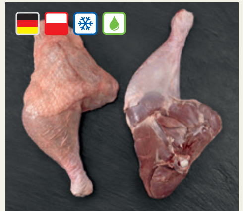
Turkey leg quarter, male