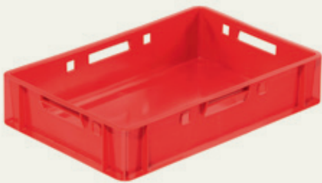
E1 crates *

Trays | Cartons | E1 crates | Euro pallets | H1 pallets | One-way pallets | 400 or 600kg bins | Block frozen | Bulk frozen | Individually Quick Frozen (IQF)