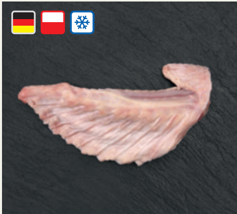
Turkey wing tip