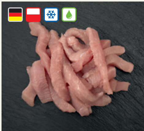
Turkey fillet stripe