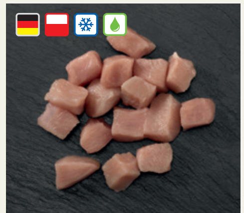
Chicken fillet cube