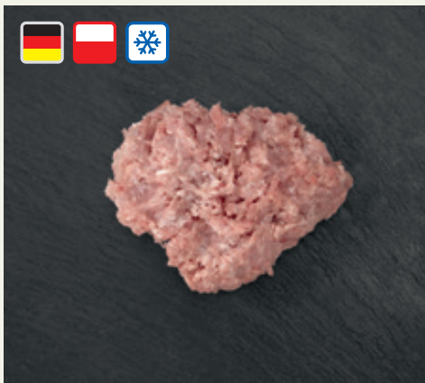
Turkey processed meat, 3mm white (baader)