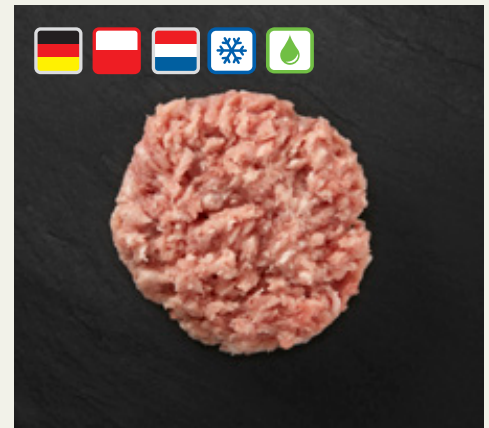
Chicken thigh meat with skin 3mm (baader)