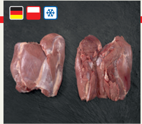
Turkey thigh meat without skin and bones