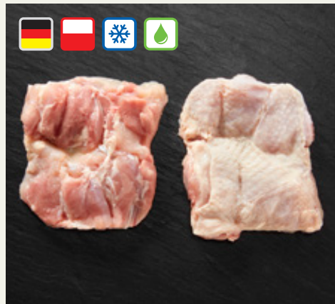
Chicken leg meat with skin