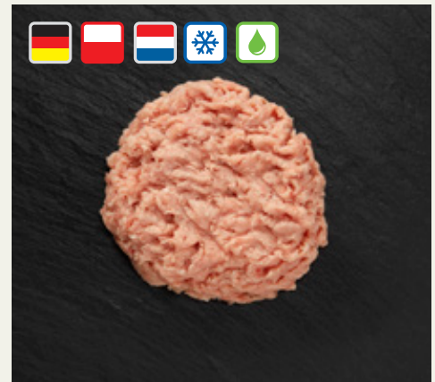
Chicken leg meat without skin 3mm (baader)