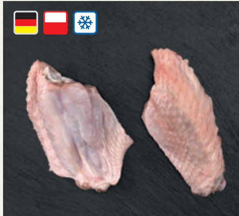
Turkey mid wing