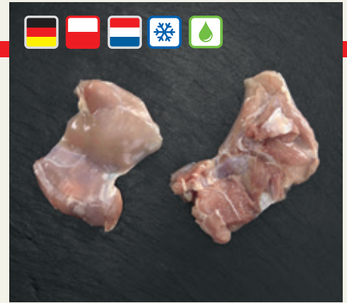
Chicken thigh meat without skin