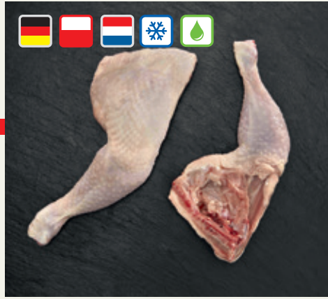
Chicken leg quarter