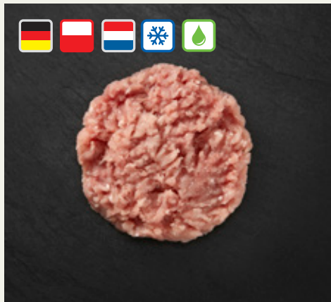
Chicken thigh meat without skin 3mm (baader)