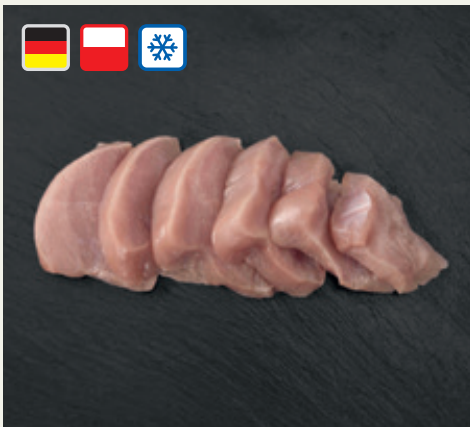
Turkey mini escalope