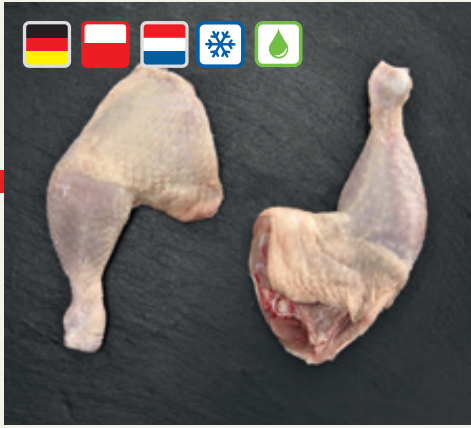
Chicken leg oystercut