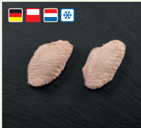
Chicken mid wing