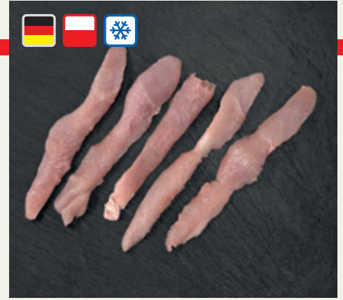
Turkey breast trimming