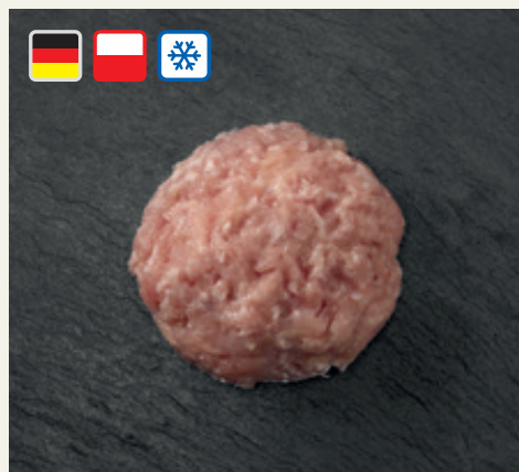
Chicken processed meat 3 mm (baader)