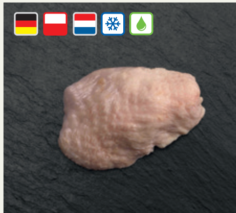
Chicken breast skin