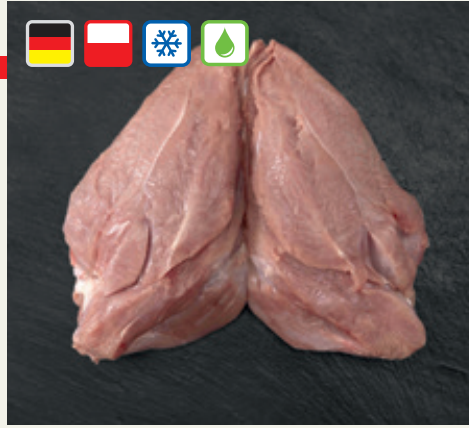
Turkey butterfly with skin