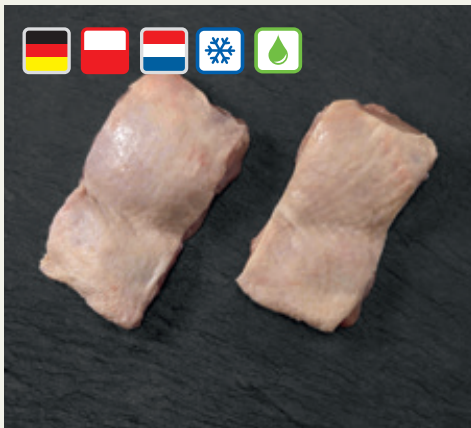
Chicken thigh meat with skin