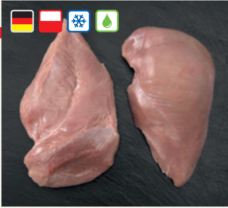
Turkey breast without skin