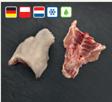
Chicken upper back