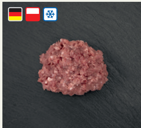
Turkey processed meat, 3mm red (baader)