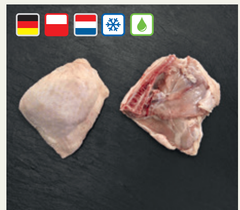
Chicken thigh with backbone