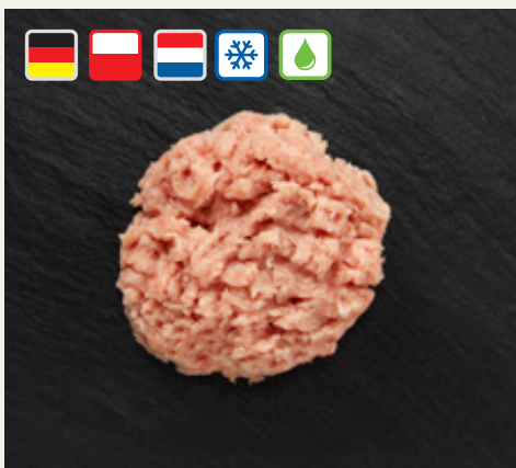
Chicken leg meat with skin 3mm (baader)