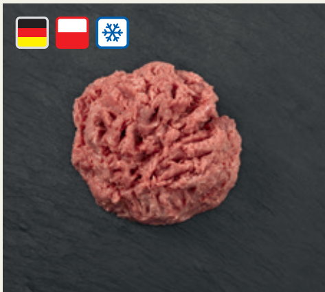
Chicken mechanically separated meat