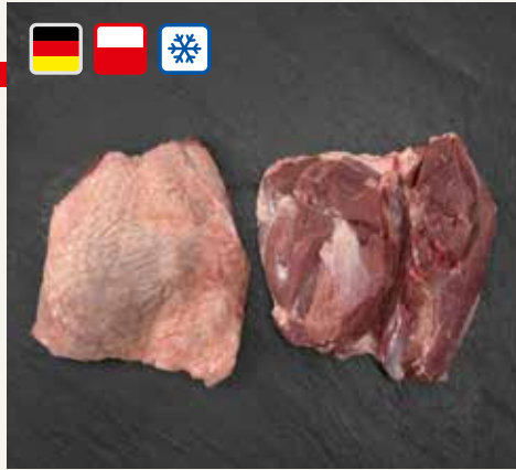
Turkey thigh meat with skin