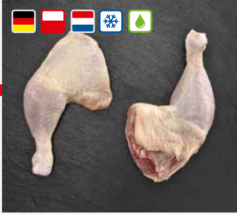
Chicken leg oystercut