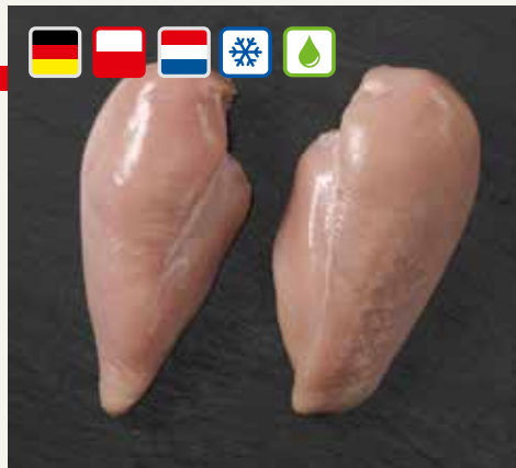
Halved chicken breast fillet without skin