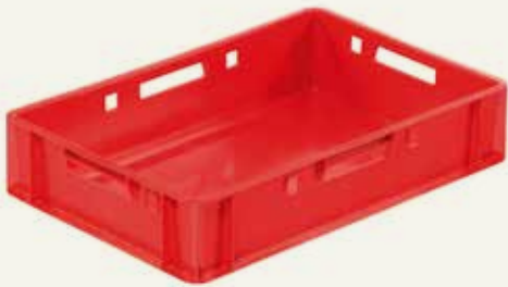
E1 crates *

Trays | Cartons | E1 crates | Euro pallets | H1 pallets | One-way pallets | 400 or 600kg bins | Block frozen | Bulk frozen | Individually Quick Frozen (IQF)