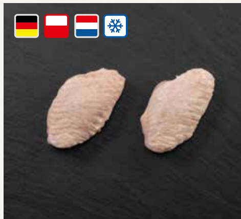
Chicken mid wing