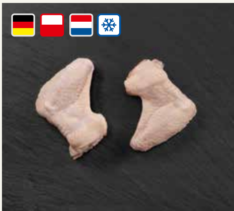
Chicken wing, two-joint