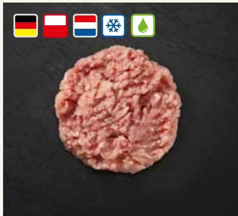
Chicken thigh meat without skin 3mm (baader)