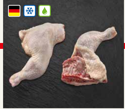
Chicken leg quarter with tail