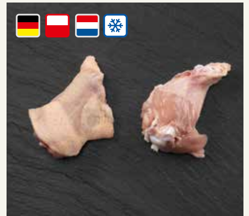
Chicken prime wing