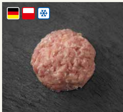
Chicken processed meat 3 mm (baader)