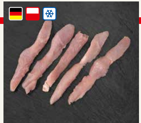
Turkey breast trimming