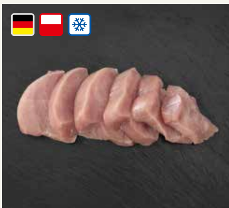
Turkey mini escalope