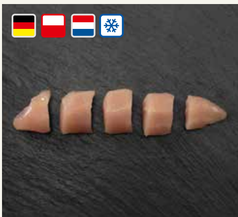
Chicken inner fillet trimming