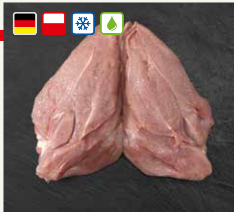
Turkey butterfly with skin