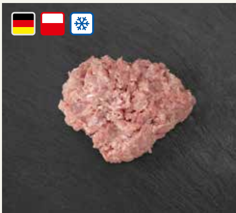
Turkey processed meat, 3mm white (baader)