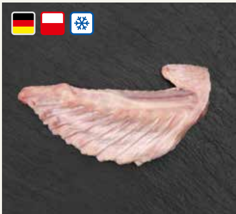
Turkey wing tip