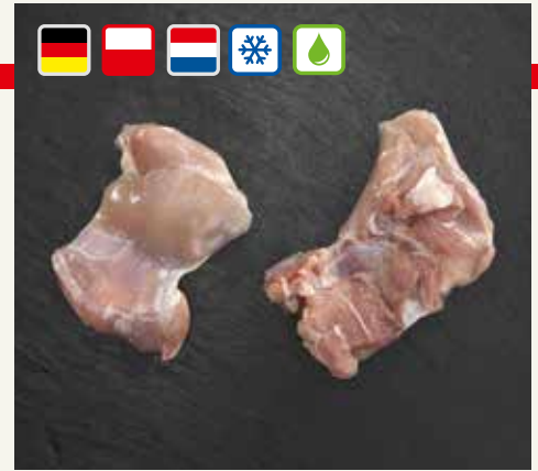
Chicken thigh meat without skin