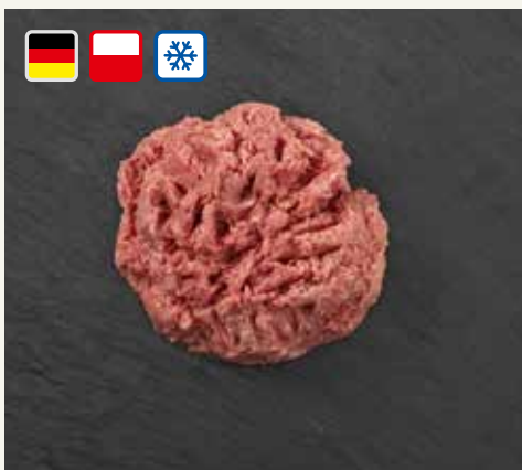
Chicken mechanically separated meat