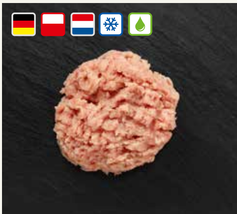
Chicken leg meat with skin 3mm (baader)