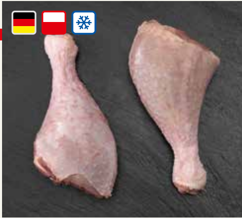
Turkey drumstick, male