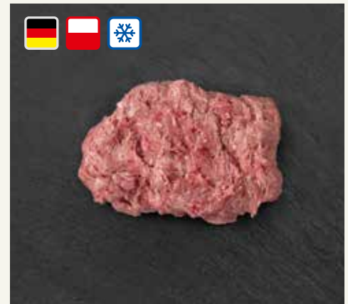
Turkey mechanically separated meat