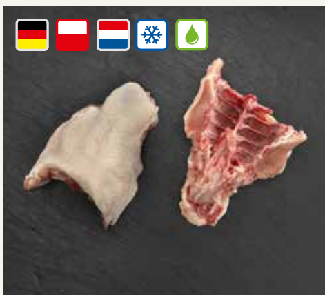
Chicken upper back