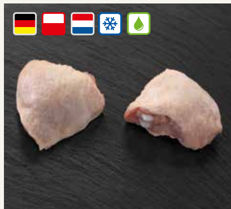
Chicken thigh oystercut