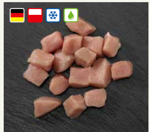
Chicken fillet cube