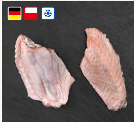
Turkey mid wing