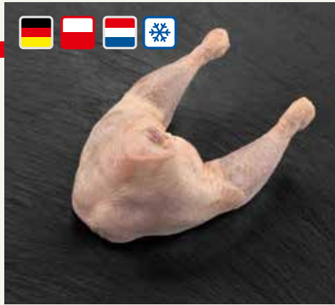
Chicken saddle without tail