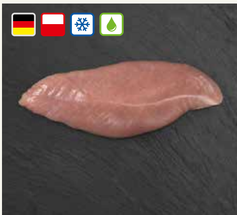
Turkey inner fillet, male