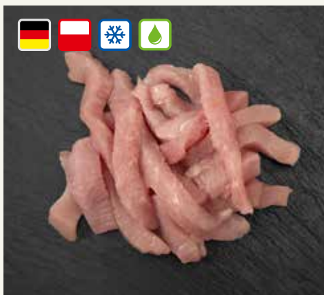
Turkey fillet stripe