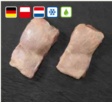
Chicken thigh meat with skin