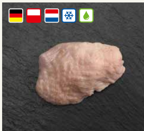
Chicken breast skin