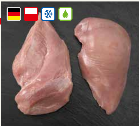
Turkey breast without skin