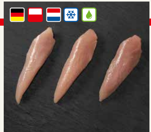
Chicken inner fillet