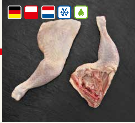
Chicken leg quarter