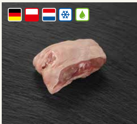
Chicken lower back