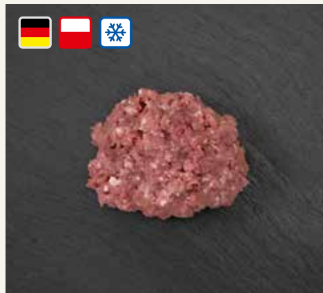
Turkey processed meat, 3mm red (baader)