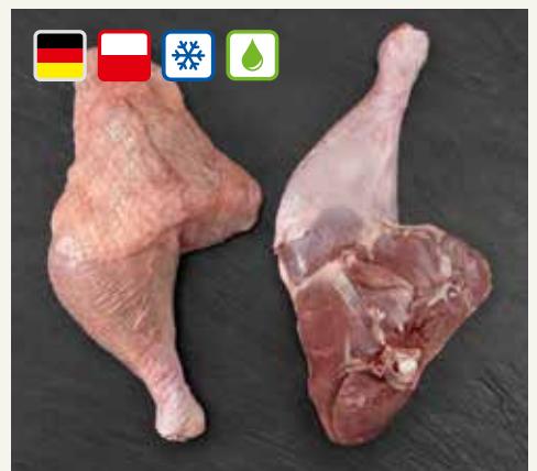
Turkey leg quarter, male