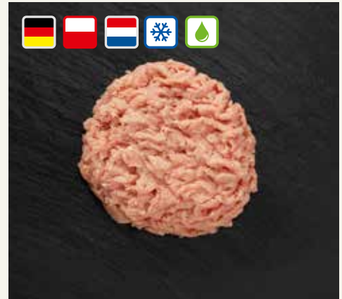
Chicken leg meat without skin 3mm (baader)