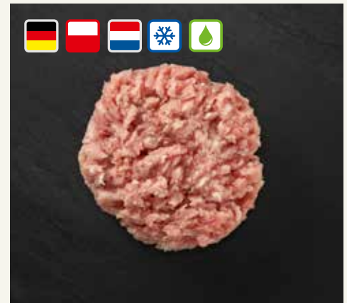
Chicken thigh meat with skin 3mm (baader)