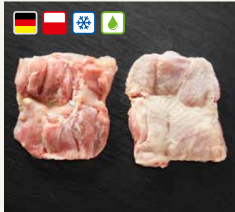
Chicken leg meat with skin