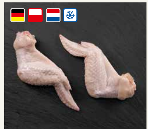
Chicken wing, three-joint