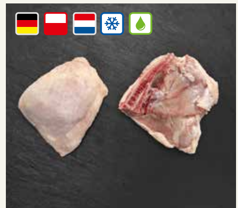
Chicken thigh with backbone